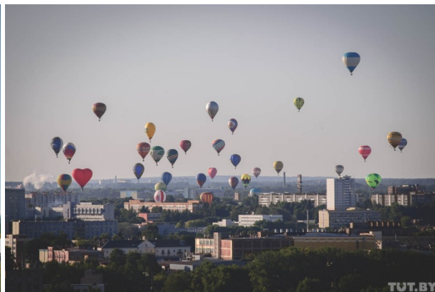
2nd Belarusian Air Sports Festival (June 2015)